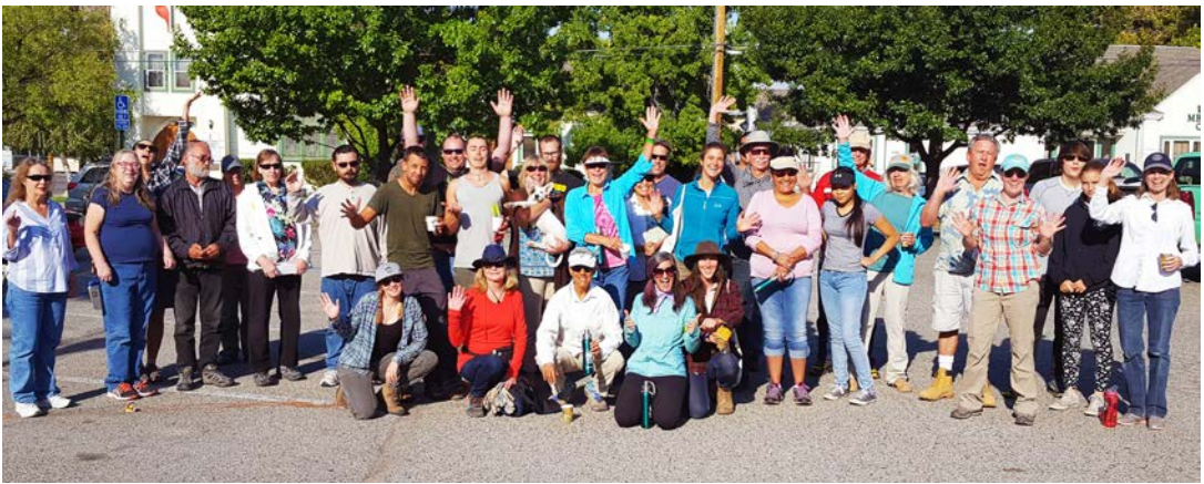
Photo Caption 1: The Great Sierra River Cleanup is one of the largest volunteer events in the Sierra Nevada. It has helped clean almost 3,000 miles of river.