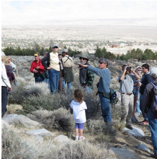
Photo Caption 1: Attendees at ESLT's 2013 Mule Deer Migration Corridor Field Trip survey the spectacular view and scout for deer as seen from Swall Meadows.