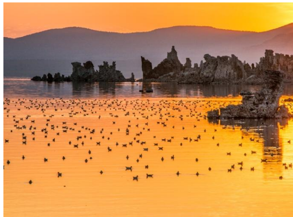
Phalaropes South Tufa