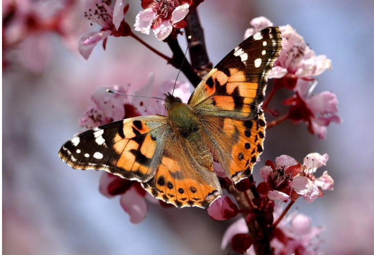
Photo Caption 1: A Painted Lady butterfly, one of the many pollinators you could attract with your certified garden!

High resolution photo available upon request by contacting Sara at (760) 873-4554.